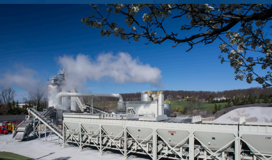
View of the Westminster plant, with a row of aggregate bins in the foreground.

BGE's program made selecting qualifying equipment and determining available incentives easy, because no complex engineering analyses were required. The BGE account manager walked him through the predetermined incentive levels for prescriptive VFD equipment.