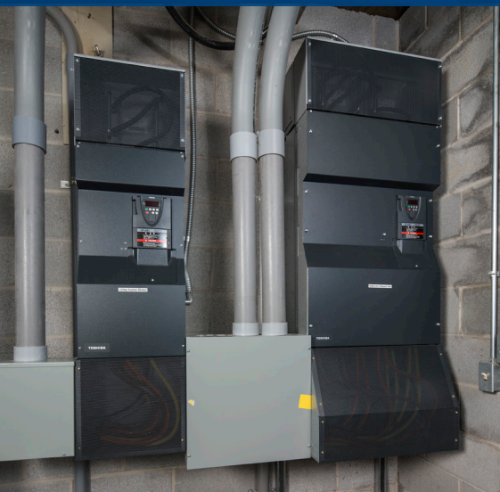
The VFD on the left operates a 150-horsepower burner blower, while the one on the right controls a baghouse exhaust fan.