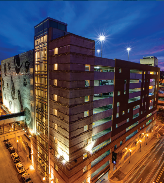
Retrofitting 460 metal halide fixtures with LED lighting reduced energy demand by 125 watts per fixture throughout the parking garage.